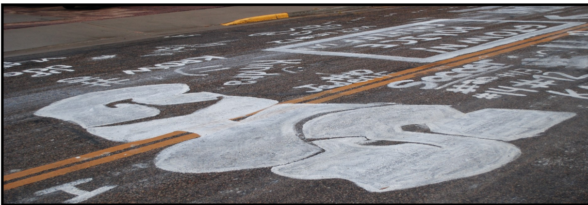
Main Street was splattered with Blue Dragon pride written in white paint on Thursday night in preparation for the homecoming festivities in the community on Friday before the football game.

The student body seemed to enjoy the experience overall but also gave some suggestions for improvements if this will last for years to come.