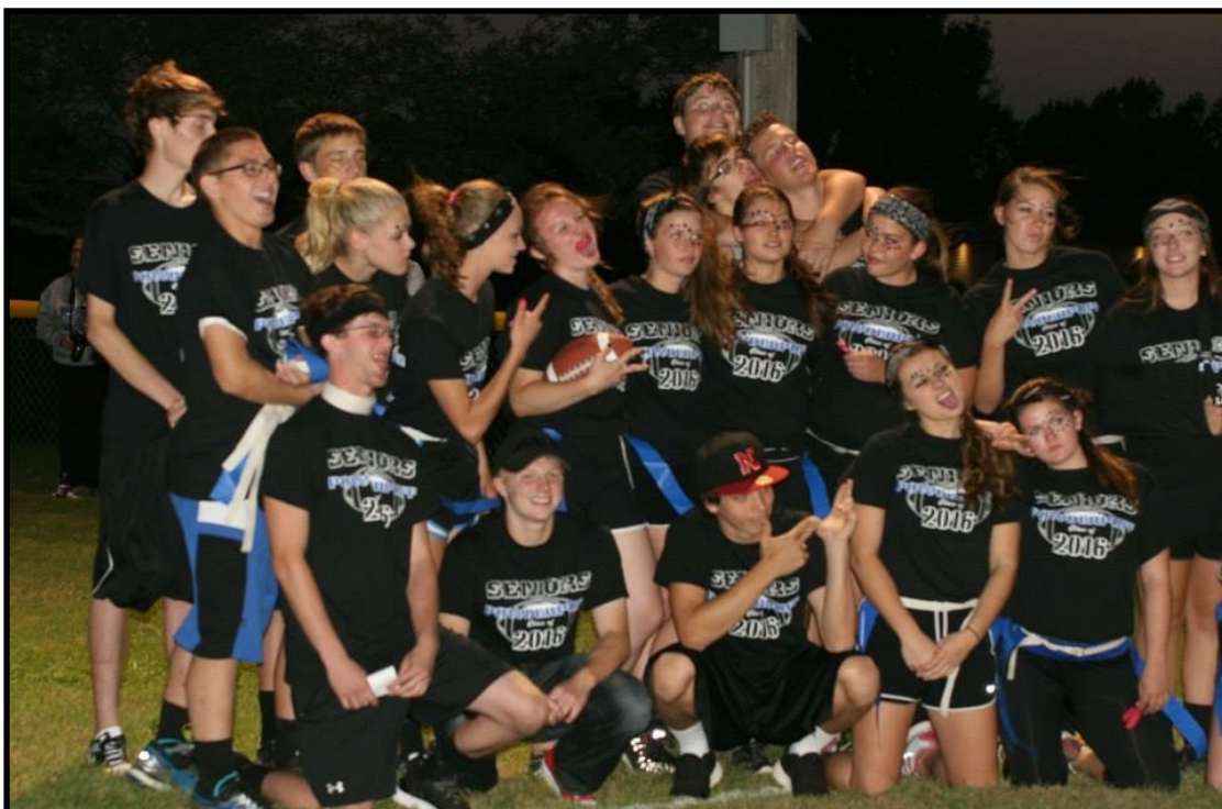
The senior class enjoys the thrill of holding the title of Powderpuff Champions during their final year at Garretson High School.

After all were served, Garretson kept with their "throwback" theme for homecoming by burning the big G, ending a fun-filled, first day of homecoming week.