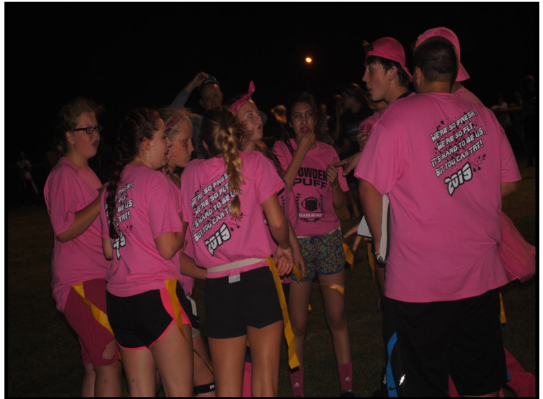
Freshmen talk strategy in attempts to not finish in fourth place in their inaugural appearance in the annual powderpuff tournament.