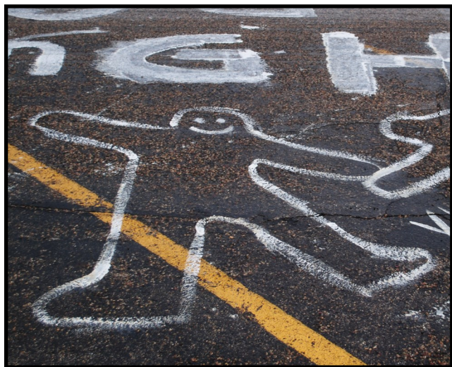
The students used the whitewash opportunity to express not only their Blue Dragon pride but also their creativity.

Senior Saige Gullickson also commented, "It was something fun we